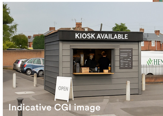
Indicative CGI image

Each party is responsible for their own legal costs in connection with the granting of a lease.